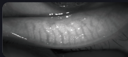
Meibomian gland imaging captured with SL-D701 slit lamp + DC-4 Digital Camera + BG-5 background illuminator. 2

Infrared illumination enables detailed visualization and documentation of meibomian gland structure and health.